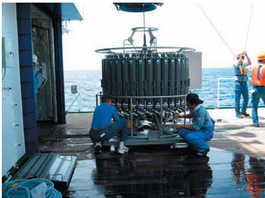
FIG. 2. Sampling of seawater and particles for the measurement of natural radiotracers.

It is necessary to determine accurately radionuclides in many types of samples for a variety of reasons, including the trade of food products, pollution assessments and remediation. The extensive trade in fish and other seafood products, for example, requires the assessment of, among other pollutants, radionuclides. Assistance