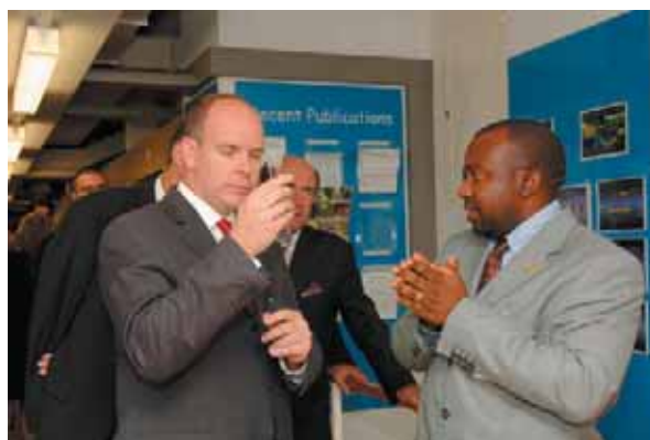
FIG. 3. Visit of HSH Prince Albert II of Monaco to the Agency's Laboratories, Seibersdorf.

“Approximately 400 laboratories took part in the first worldwide interlaboratory comparison exercise for gamma emitting radionuclides in environmental matrices.”