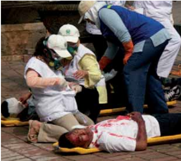
FIG. 2. A medical team treating a simulated victim during a radiological emergency exercise in Indonesia.

during the response to a radiation emergency. This framework was published and discussed with Member States and other international organizations at a technical committee meeting.