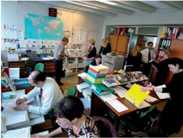
FIG. 3. IEC staff involved in ConvEx-3 (2005).

The third meeting of the representatives of competent authorities identified under the Early Notification and Assistance Conventions was held in Vienna in July 2005. The meeting reviewed progress and approved proposals relating to strategies for enhancing international assistance and international communication in the event of a nuclear or radiological incident or emergency, and reviewed the evaluation of ConvEx-3 (2005). Participants agreed on a proposal for enhancing the existing drill and exercise schedule, recommending that it cover all regions over a suitable time period, and that the exercises address both nuclear accidents and