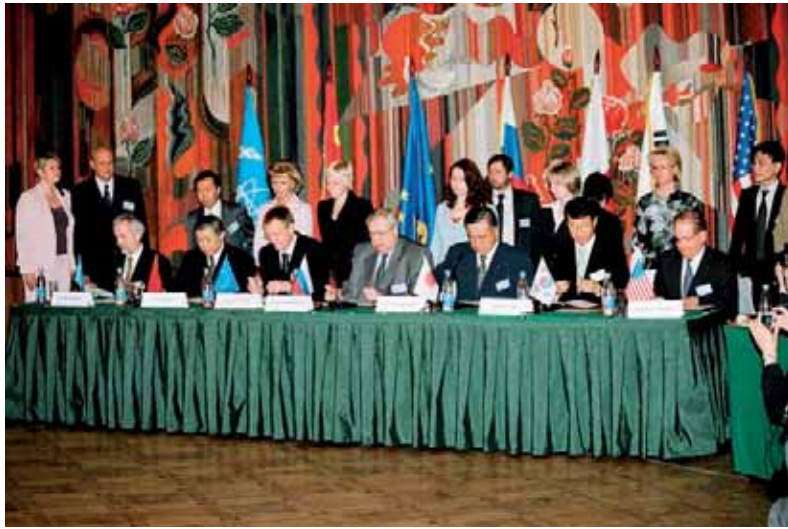
FIG. 2. Signing of the ITER declaration in June.

International Thermonuclear Experimental Reactor (ITER) (Fig. 2). 1 The partners agreed on future arrangements and on the construction of ITER at Cadarache, in France.