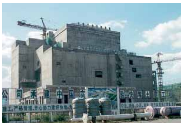
FIG. 2. The China Experimental Fast Reactor under construction.

In the field of high temperature gas cooled reactors (HTGR), two Agency CRPs promoted R&D on: (a) core physics and thermal-hydraulic code benchmarks; and (b) coated fuel particle technology. In 2004, the former completed and analysed results for a second set of code benchmarks, and the latter focused on issues of HTGR fuel