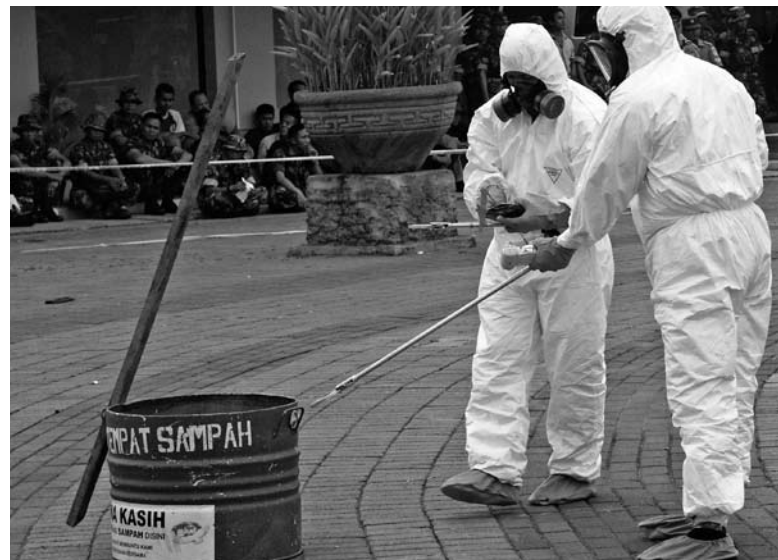
Radiation experts successfully track down radioactive material during a “dirty bomb” training exercise in Indonesia in 2005.

◆ National officials have not been effective in directing the first response. Only local officials should direct the first response with support from the national authorities if required.