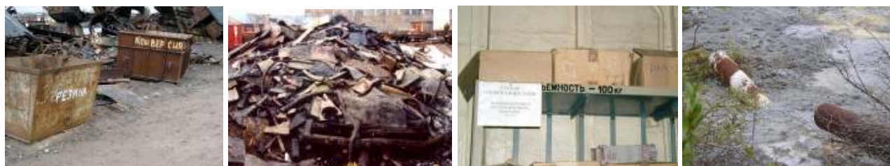
Fig. 2. Gathering and storage of rubber materials (a), mercury lamps (b) and carbide sludge (c)

Each type of TW is handled individually depending on physical state, physical and chemical properties, health hazard and environmental hazard. TW are stored at sites of enterprises in accordance with special “authorizations” and “quantity limits” established on agreement with environmental supervisory authorities. However to date the existing industrial-waste sites do not cope with increasing TW amounts [15,16], and each enterprise has to establish new temporary pads depending on its own resources that is fraught with violations of the regulations and standards in force. Some TW is burnable that augments fire hazard. Thus the actual TW-handling procedures are reduced to: gathering, assortment, storage or partial processing, elimination, transfer to other enterprises and removal to city dumps, wherever possible (Fig. 2, Table 2).