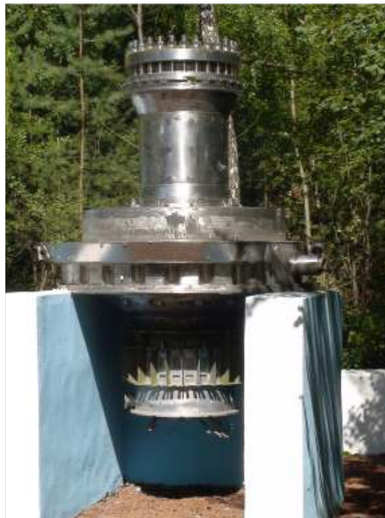
Transportable nuclear reactor designed by SOSNY, Belarus.

Six meetings have been held so far to advance the study which will result in a report to be published by the IAEA. Available legislation and existing regimes for safety, security, safeguards and liability have been considered.