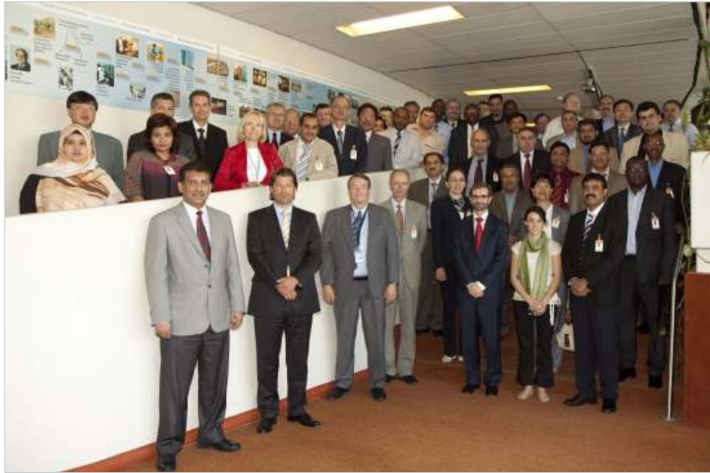
Fifty participants from over 40 countries attended the Workshop at the IAEA Headquarters

and lessons learned and identify needs for support from the IAEA.