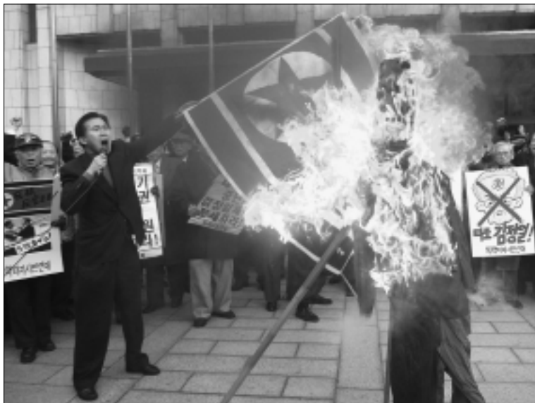
Protesters in Seoul, South Korea, burn a North Korean flag and an effigy of Kim Jong Il on Dec. 28, 2003, calling on North Korea’s leader to end the country’s efforts to build a nuclear bomb.