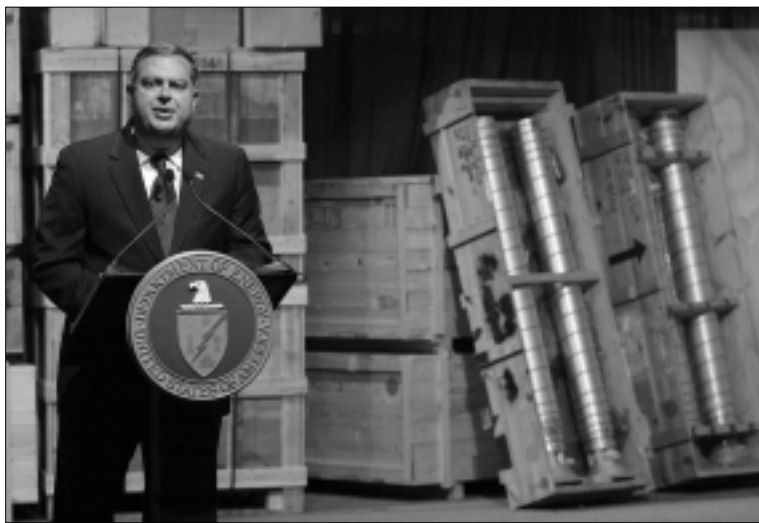
Components from Libya's nuclear weapons program are displayed by Secretary of Energy Spencer Abraham at the Y-12 National Security Complex in Oak Ridge, Tenn., on March 15, 2004. Libyan leader Muammar el-Qaddafi ended the country's isolation by renouncing weapons of mass destruction and joining the world nonproliferation regime.

nuclear-armed country to voluntarily dismantle its entire nuclear-weapon program.