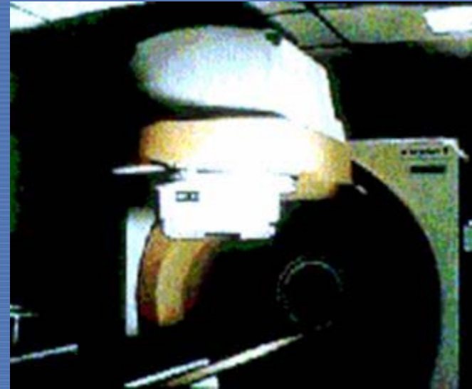
Alcyon CGR II unit